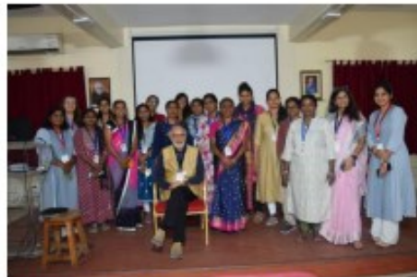
DGS - Community Health Workers, KEM - Diabetes Unit and Cornell teams at the conference

The most relevant discussion for the study was around the limitations faced by the Public Health Department in reaching women. Through the study Community Health Workers(CHWs) have reached out to and home screened over 300 women from low income communities and over a 100 women who tested positive for GDM have been enrolled in the study. Our CHWs were recruited from the communities that they collect data from and have been trained by the team from KEM's Diabetes Unit. It is an incredible privilege to be part of an intervention that supports empowerment of community members to better look after their own community.